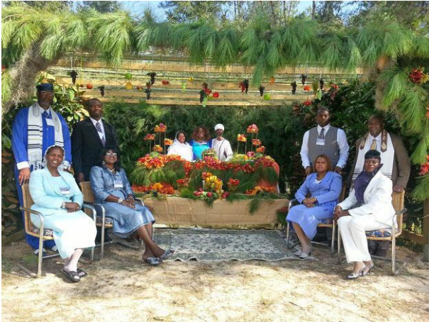
Booth, Feast of Tabernacles 2014, Sylvania, GA

Nine days later, the church observes the Day of Atonement – Yom Kippur ( Leviticus 23:26-32 ) a day of fasting ( Acts 27:9 Amp ) that pictures the time of Judgment (being past each year behind the veil and future Judgment of the world and) when Satan and forces of evil will be bound at the beginning of Messiah's coming one thousand year long reign ( Revelations 20:1-3 ). It is also a time of repentance and preparation prior to going before the king (Yahshua to be judged). The Day of Atonement is seen in the history of the early church in the book of Acts (27:9 AMP) .