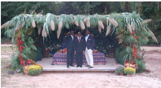
Booth, Feast of Tabernacle Convocation, 2015, Sylvania, Ga

Yahweh (the LORD) Father (God) Tabernacles with men forever